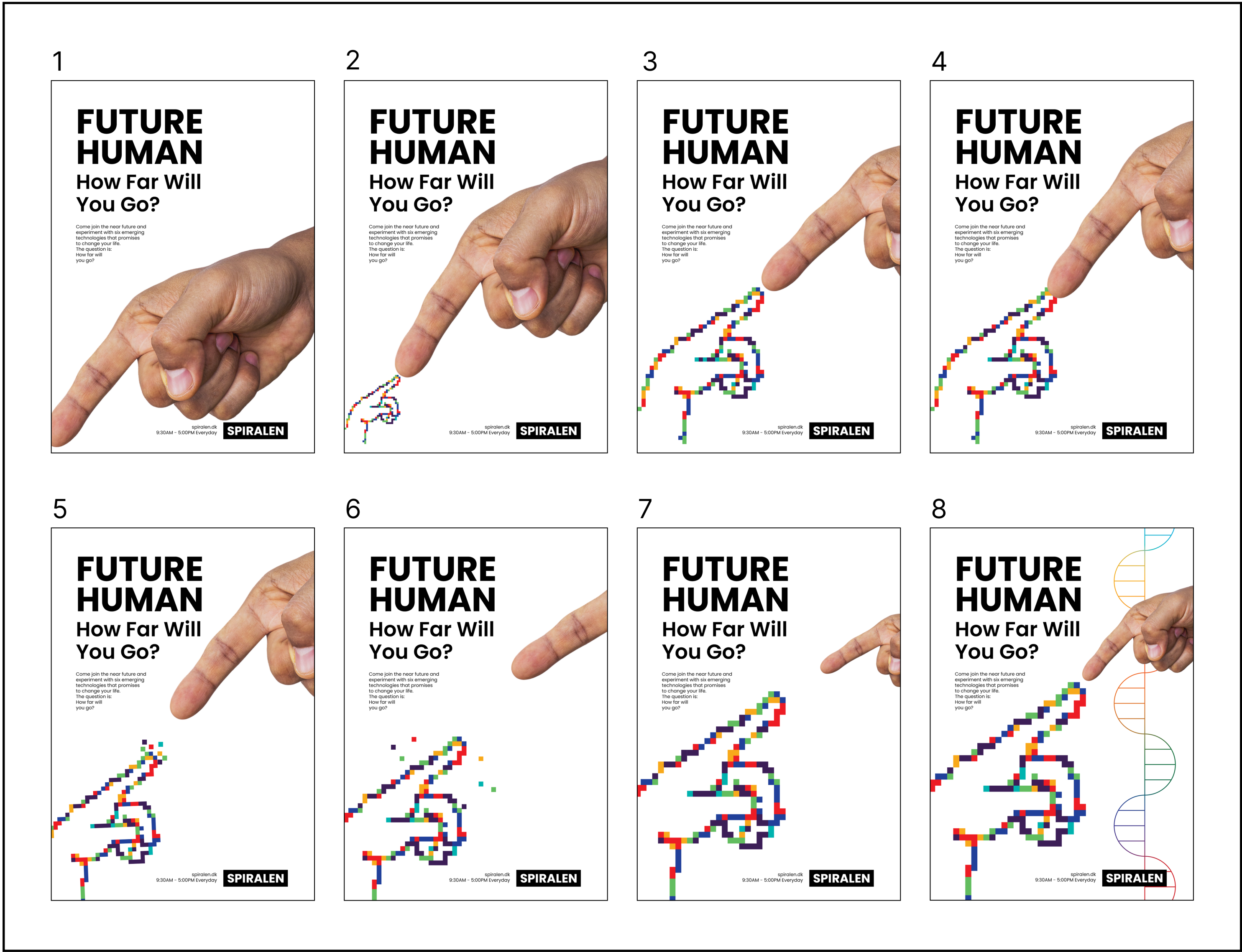
STORYBOARD This storyboard animates the exhibition poster. The human hand draws the pixelated hand, and the two interact through crashing, expanding, and shrinking, illustrating the dynamic relationship and tension between humanity and technology.