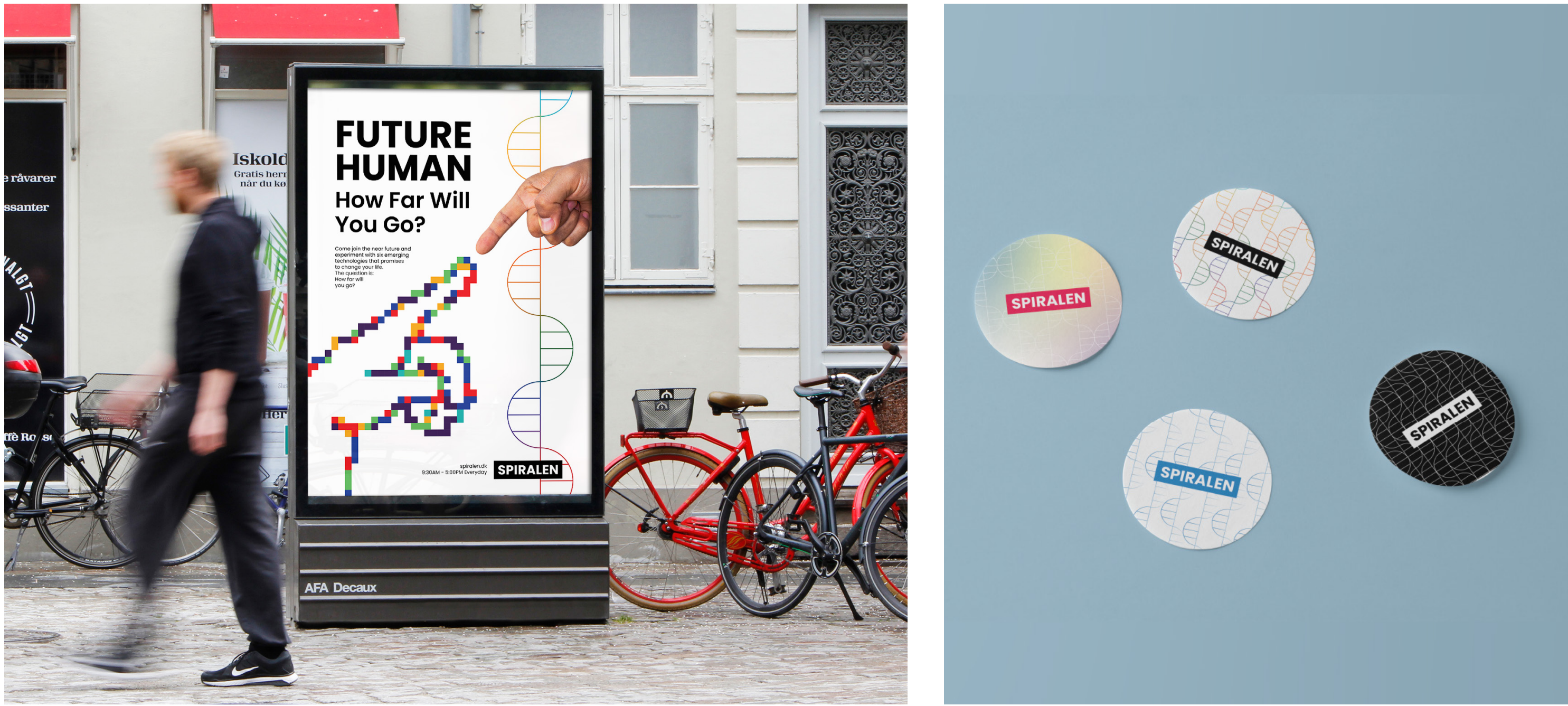
OUTDOOR POSTER EXAMPLE The Future Human poster is shown in an outdoor Danish setting.